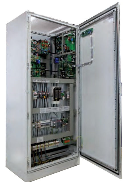
Fig.4 Wärtsilä JOVYMED system